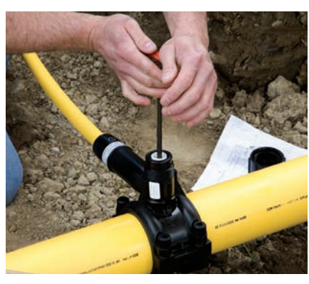
By-pass is made easy with a PermaLock tapping tee