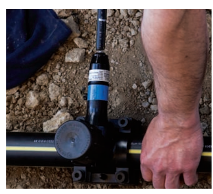
PermaLock tapping tees with PermaTite® cap and EFV excess flow valves are an excellent way to ensure the safe delivery of gas.