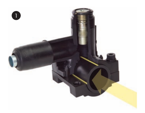
PermaLock full-encirclement tee is bolted onto the main.

The Permatite Cap's unique shaft seal design allows for easy hand tightening of the cap, eliminating the stress associated with other tees that require a wrench for cap assembly. Also, our unique manufacturing process provides an o-ring gland free of potential leak paths.