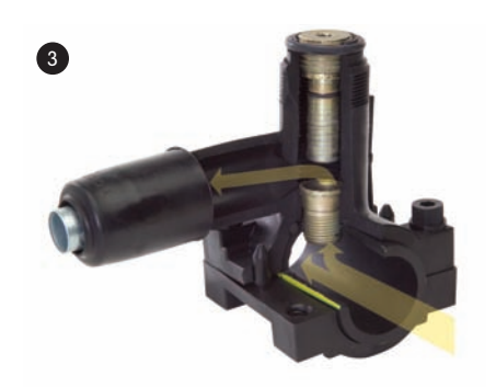
Cutter is reversed until flush with the top of tower. Locking sleeve remains permanently threaded into the gas main.