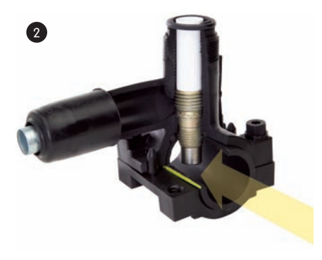
Patented ratchet-style cutter assembly is threaded into the main.