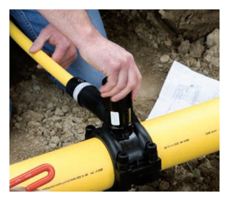
PermaLock tapping tees allow for a much smaller excavation site compared to fusion tees.