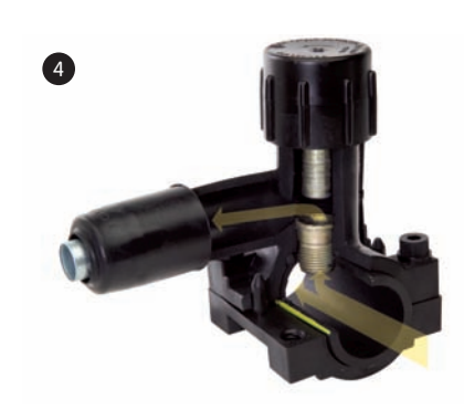
Cap is threaded onto tower. PermaLock tapping tees provide a .80" port for high gas flow (.55" in 1-1/4" mains).