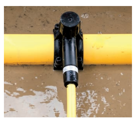
Tapping a main line in inclement weather is no problem with a PermaLock tapping tee.

The PermaLock tee eliminates these potential problems by incorporating a double-locking design. First, the full-encirclement tee is securely attached to the main with four bolts (or two stainless steel straps for PMTT's 6" and larger). Then, our patented two-piece cutter assembly, with locking sleeve, is installed. Together, they provide unsurpassed connection strength and seal integrity.